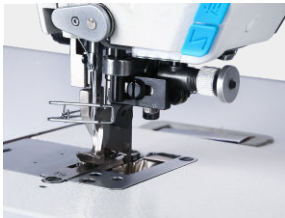
Separated cutter, good durability