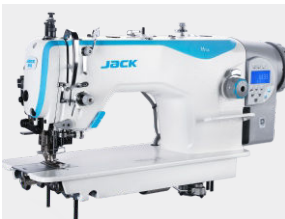
Integration of mechanical and electric, Easy to use