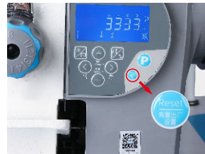
Free setting, one key reset