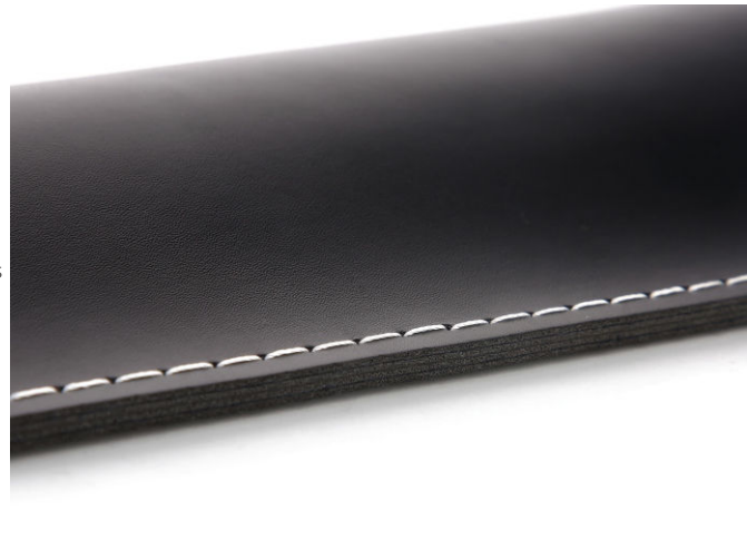
Especially for heavy duty, neat cutting edge